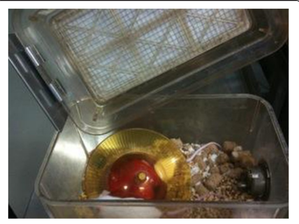
Figure 1 Cage used for environmental enrichment.

The mechanical sensitivity was assessed on the plantar surface of both hind paws. Calibrated von Frey Filaments (Stoelting Co., Wood Dale, IL) were applied to the point of bending for 4 sec or until withdrawal. Mice were acclimated to the experimental setup 60 minutes prior to testing. The stimulus intensity ranged from 0.01–4.0 g, corresponding to filament numbers 1.65 – 4.56. The 50%