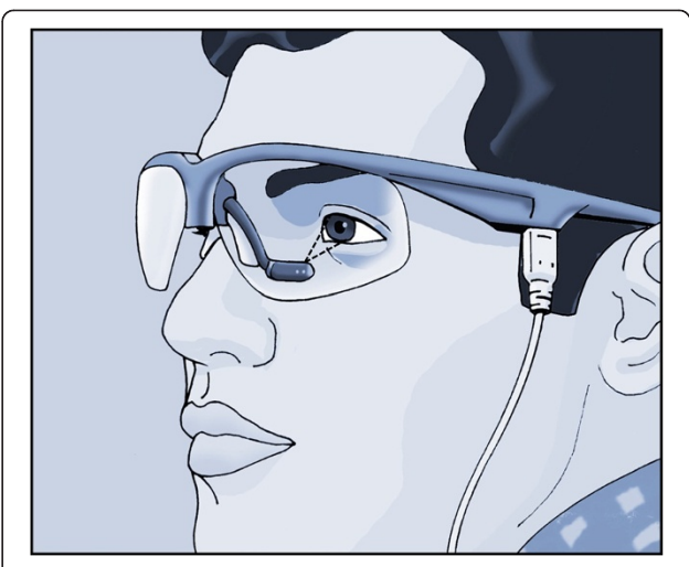
Figure 2 Optalert glasses with infrared oculography in the arm attached to the frame. The direction of the infrared light pulses directed up at the eye is shown.

The JDS utilizes infrared reflectance (IR) oculogaphy (OPTALERT™, Optalert Pty Ltd, Melbourne, Australia), to measure eyelid velocity and blink duration to estimate drowsiness [18,24]. A glass frame carrying an IR transmitter and receiver bar is positioned below and in front of the eye. Pulses of IR light (pulse-width 69 microseconds; wavelength 935 nm; frequency 500 Hz) are directed towards the lower edge of the upper eyelid. The IR exposure delivered by the system is safe for use [18]. Figure 2 shows the Optalert glasses with infrared oculography in the arm attached to the frame and indicates the direction of the infrared light pulses directed up at the eye. A combination of oculometric measurements is used to calculate the level of drowsiness, providing a minute-by-minute JDS rating [18]. The JDS is a continuous 10-point scale in which alert subjects are rated from 0 to 4 and a critically drowsy person scores above 5 [18,25]. The JDS score was derived from the mean values and standard deviations (SDs) of several variables computed each minute, including the duration and relative velocity of eyelid movements during blinks. Using proprietary software, these numbers were automatically multiplied by previously determined weights and added to calculate JDS scores for each minute of the recording [25]. The Optalert™ system measures other